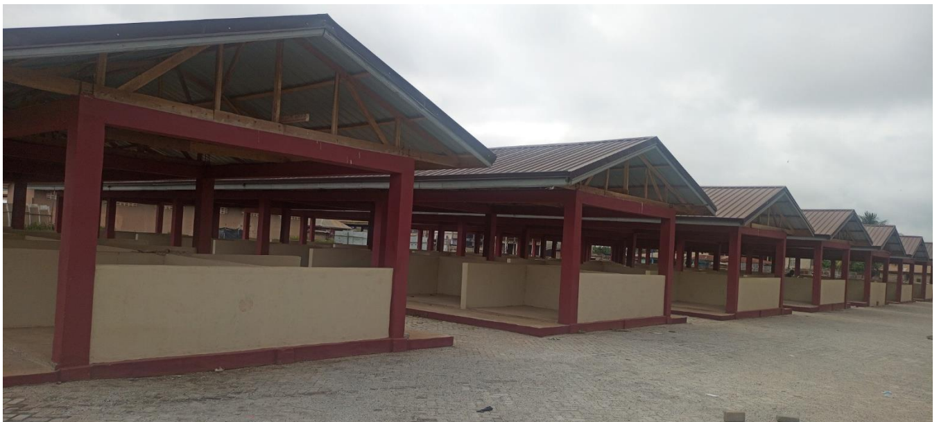
(Completed 7No. 20 Unit stalls at Berekum Thursday Market) - GSCSP