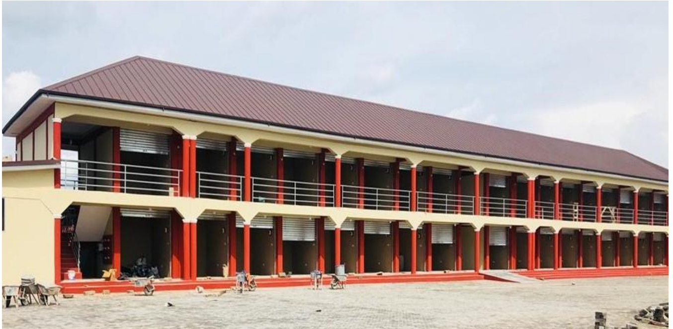
(Completed 60No. lockable stores at Berekum Thursday Market) - GSCSP