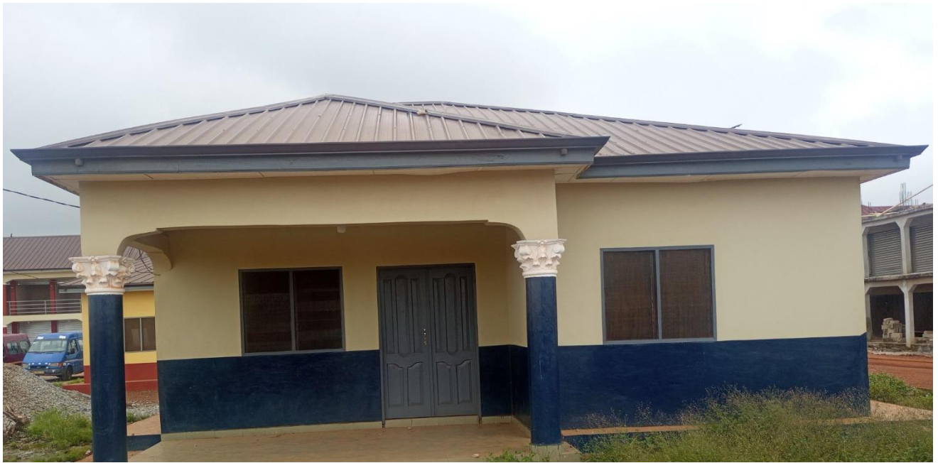
(Completed Police Post at Berekum Thursday Market) - GSCSP