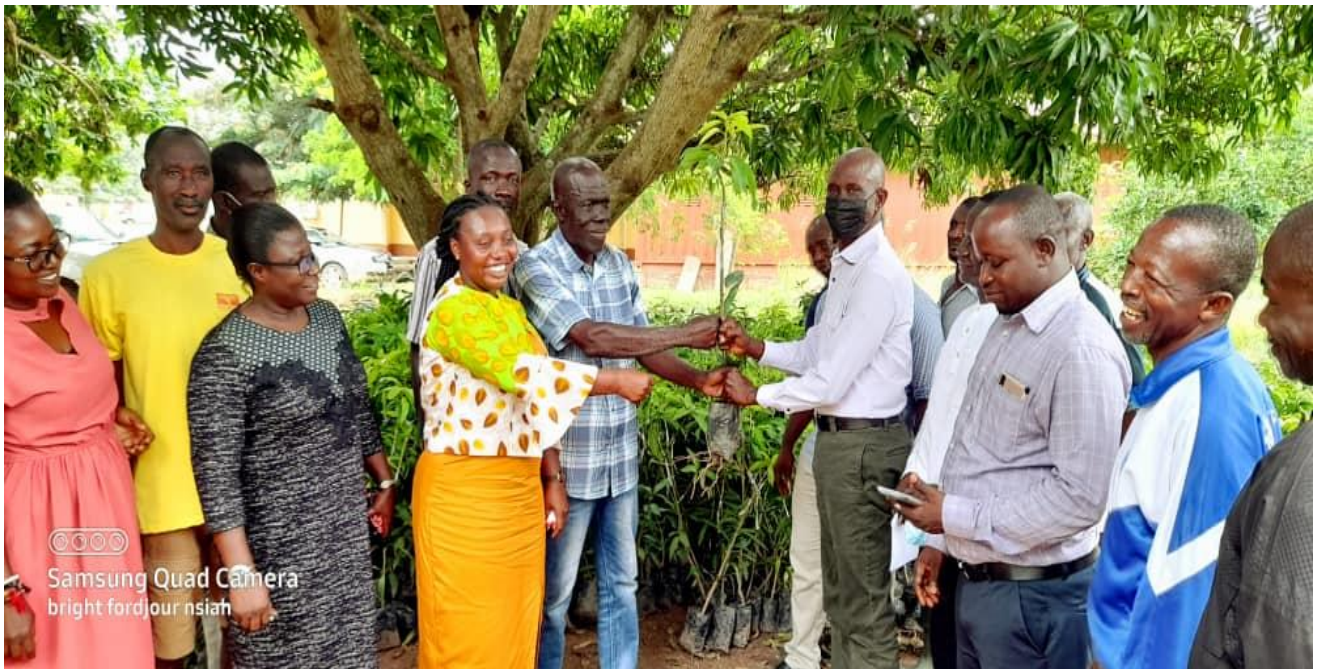
(Distributed 4,025 mango seedlings to farmers under the Planting for Export and Rural Development (PERD) programme)