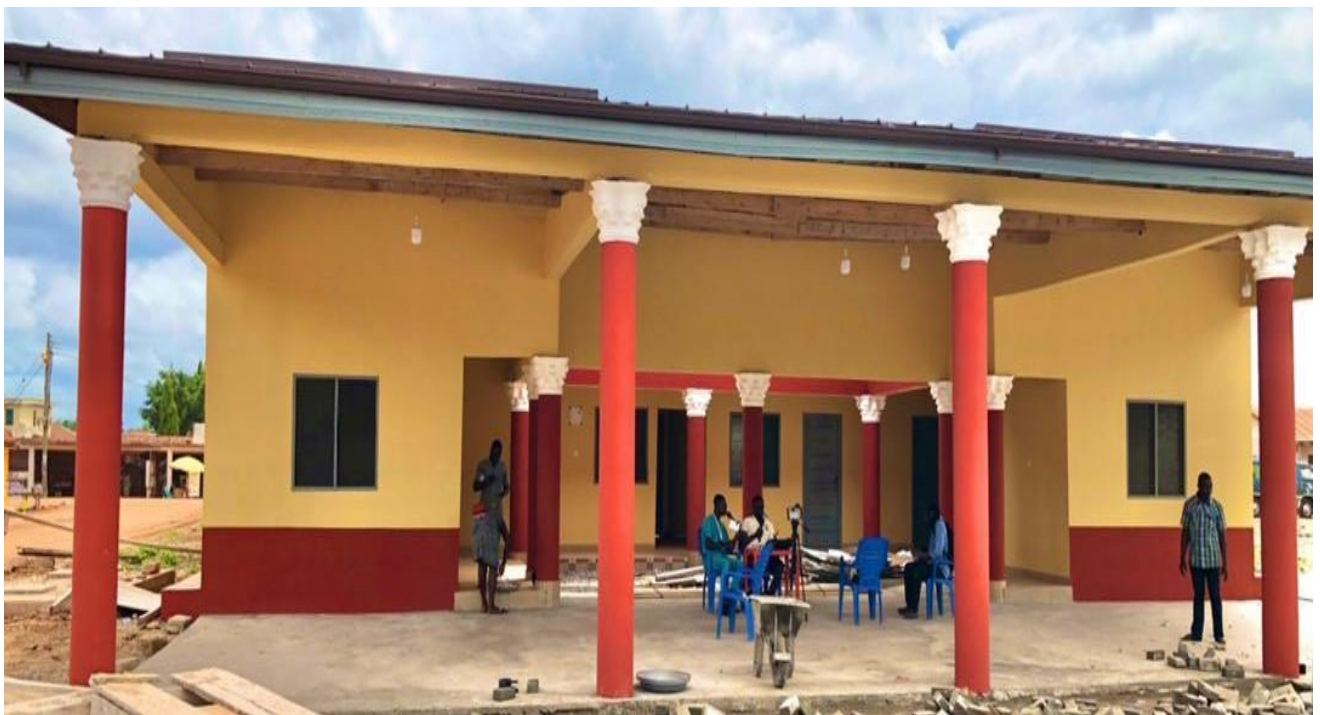
(Completed Fire Service Post at Berekum Thursday Market) - - GSCSP