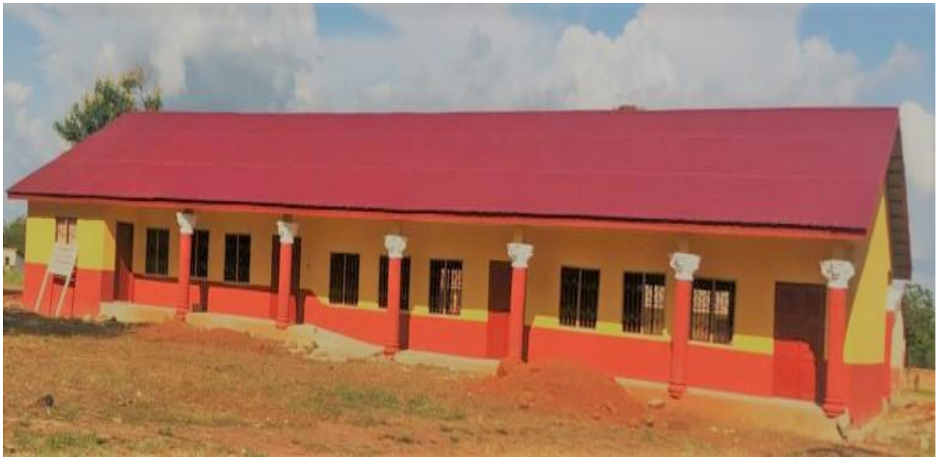
(Completed 3-unit classroom block at St Theresah's School, Berekum – DACF-RFG (Another one at BESS JHS)