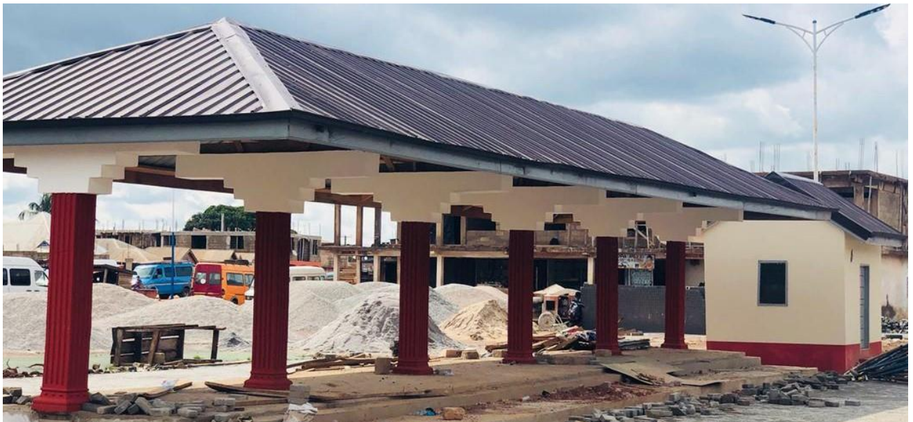
(Completed lorry station with passenger waiting shed at Berekum Thursday Market) - GSCSP