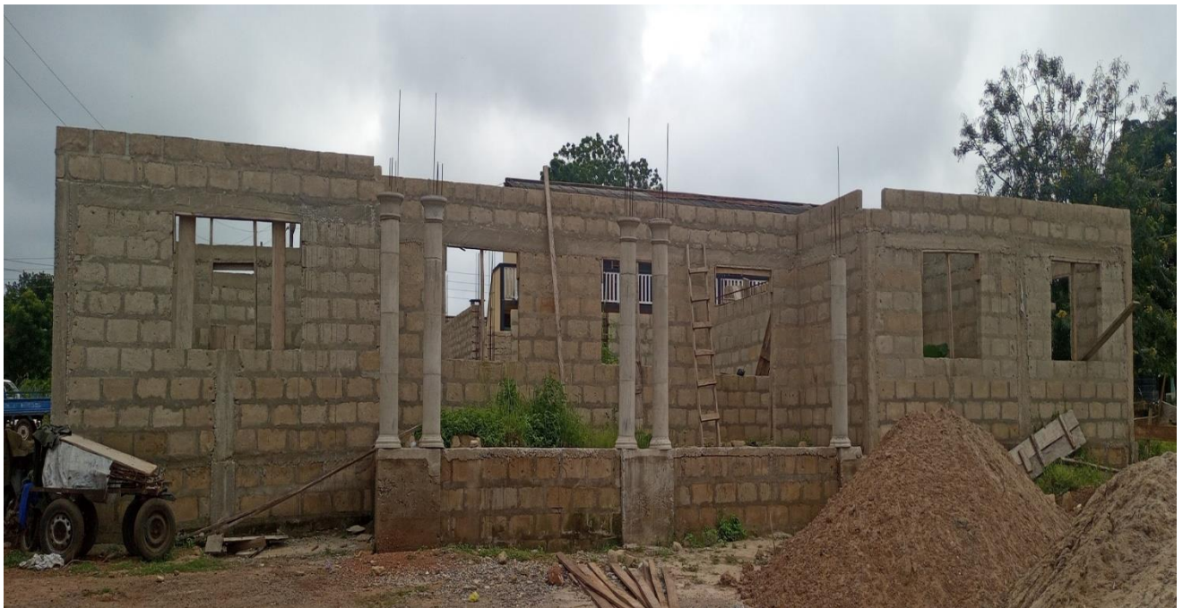
(Police station at Charge Office, Berekum – DACF-RFG)