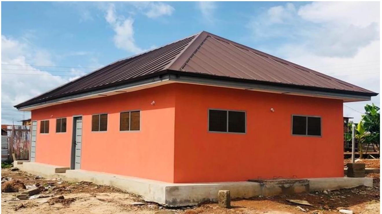
(Completed 10 seater WC Toilet and urinal facility at Berekum Thursday market) - - GSCSP