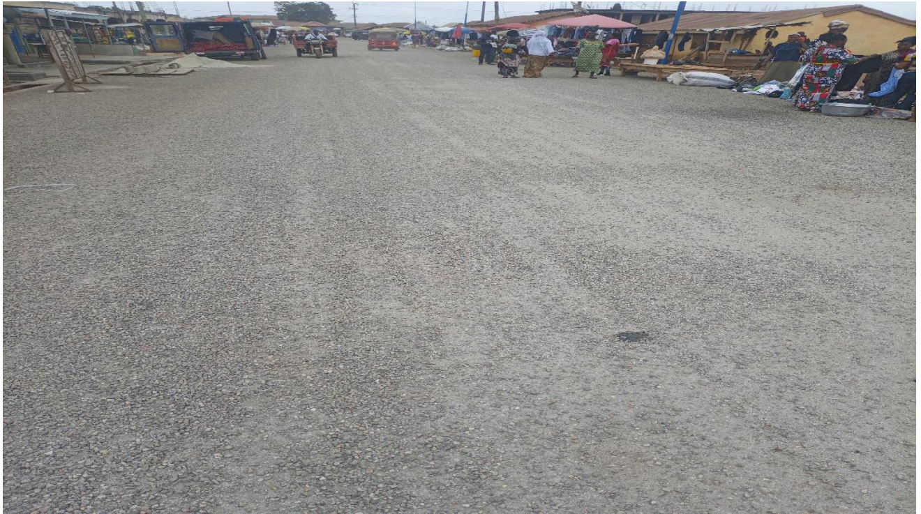
(Tarring of 1.3km road at Berekum Thursday Market) - GSCSP