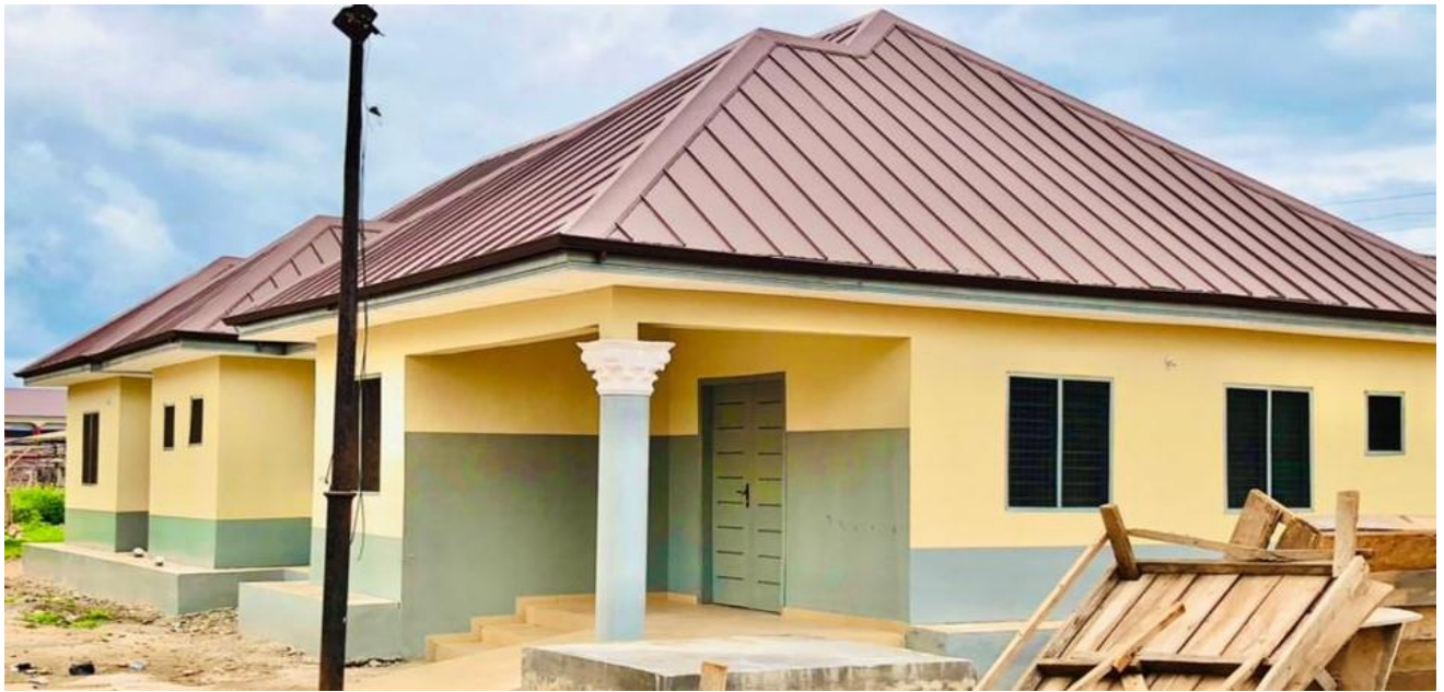
(Completed Health Post at Berekum Thursday Market)- - GSCSP