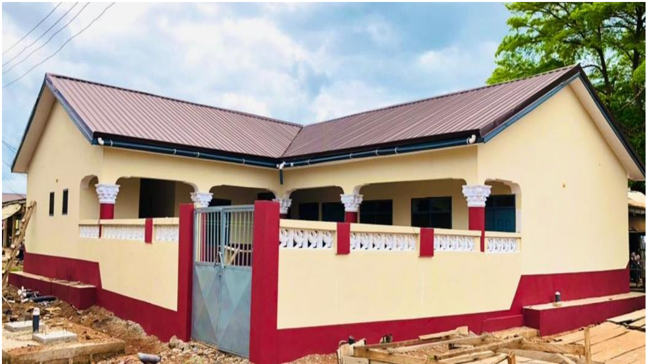
(Completed creche at Berekum Thursday Market) - GSCSP